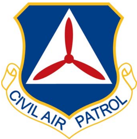
CAP Command Patch