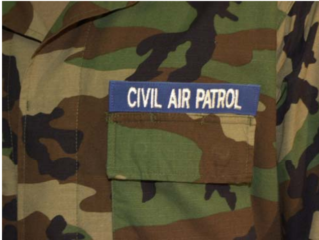
BDU and Field Uniform Civil Air Patrol Tape