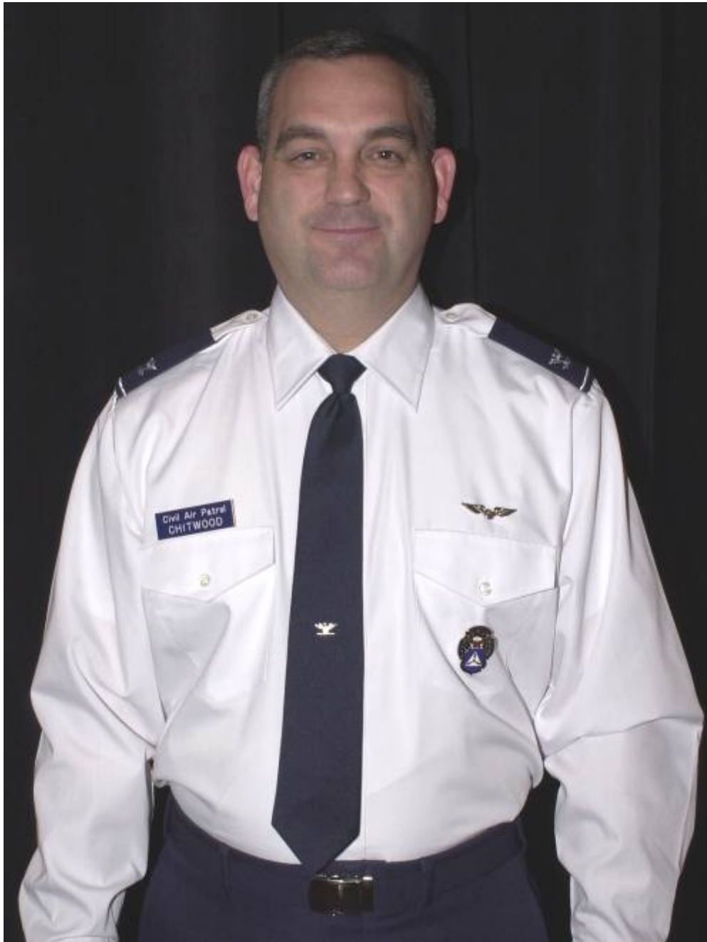
New CAP Distinctive Uniform