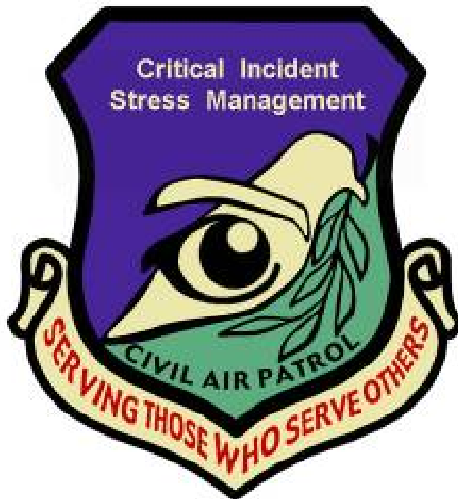
New Optional Patches