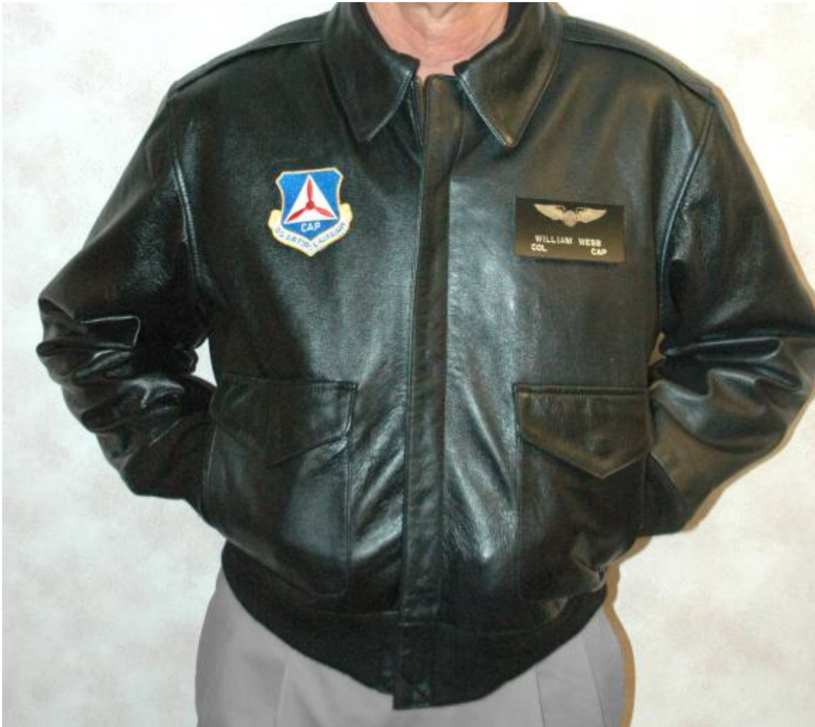
CAP Black Leather Jacket