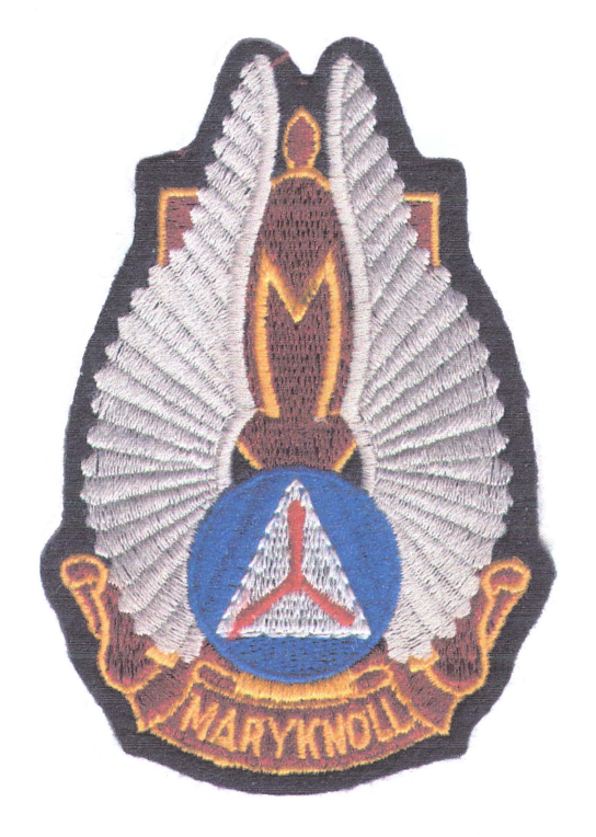
HI – Maryknoll Cadet Squadron (51030)