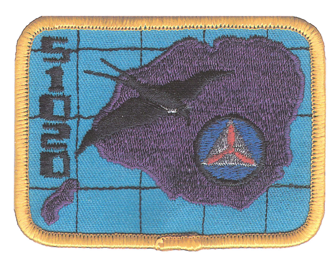
☐ HI – Port Allen Cadet Squadron (51020)