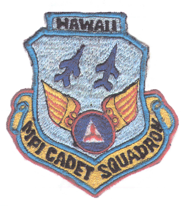
☐ HI – Mid-Pacific Institute Cadet Squadron (51075)