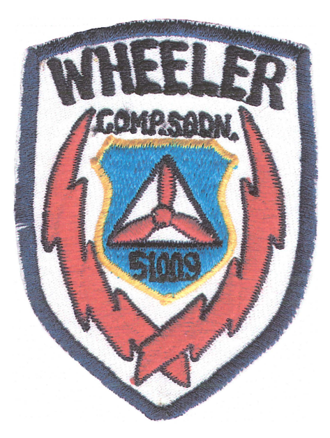
☐ HI – Wheeler Composite Squadron (51009)