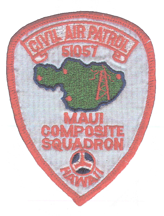
☐ HI – Maui Composite Squadron (51057