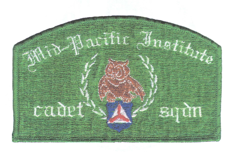
HI – Mid-Pacific Institute Cadet Sq. (51075)