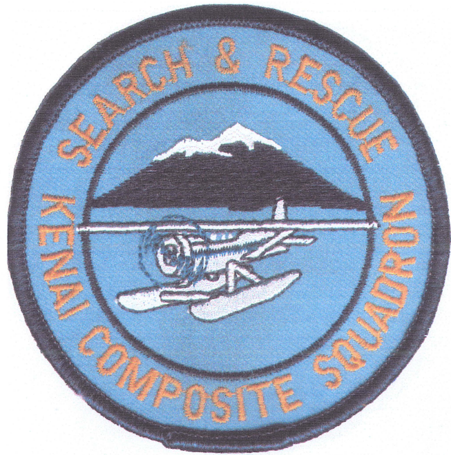
AK – Kenai Composite Squadron (AK011)