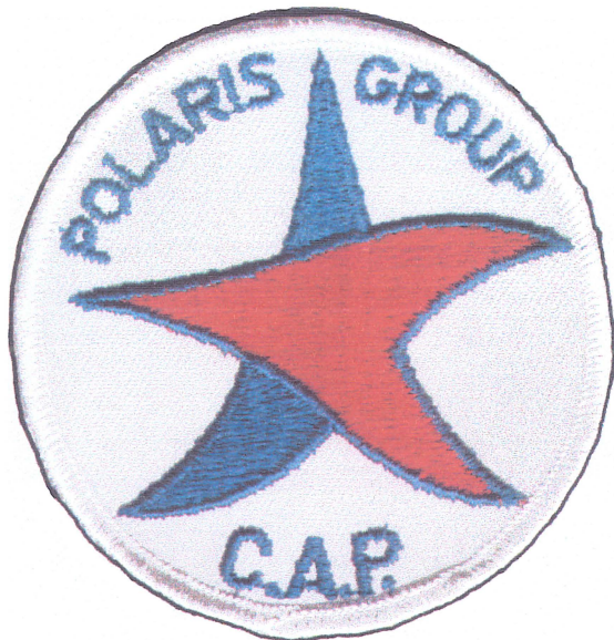
● AK – Polaris Group (50???)