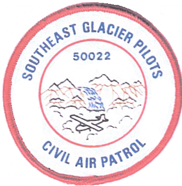
AK – Juneau Southeast Composite Sq. (AK022)