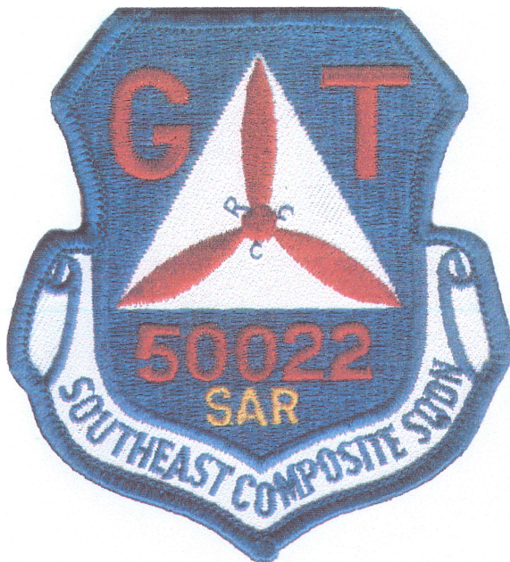
AK – Juneau Southeast Composite Sq. (50022)