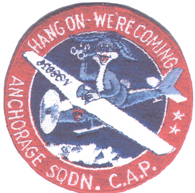
● AK – Anchorage Squadron (50???)