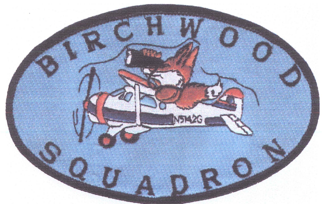
● AK – Birchwood Composite Squadron (AK 076)

Second variation. Note different aircraft serial number, larger tires, and black line above the plane. 5 ½” wide.