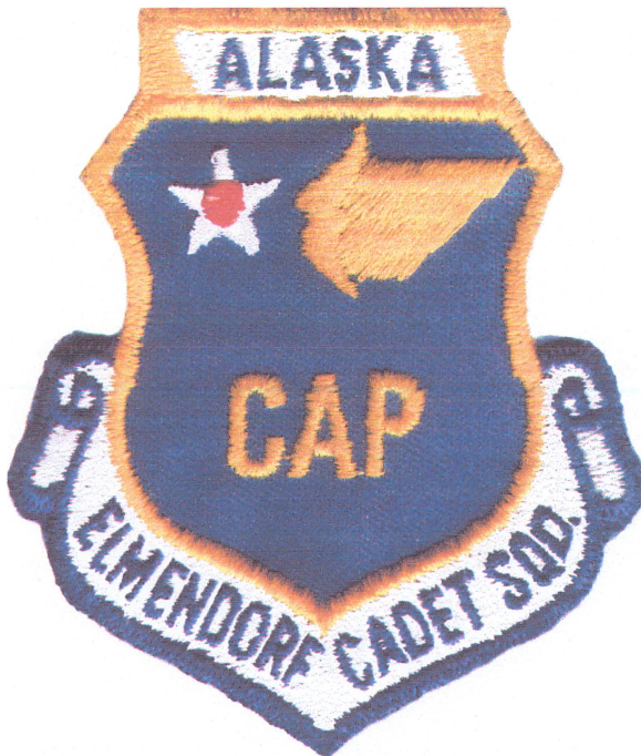
AK – Elmendorf Cadet Squadron (50???)