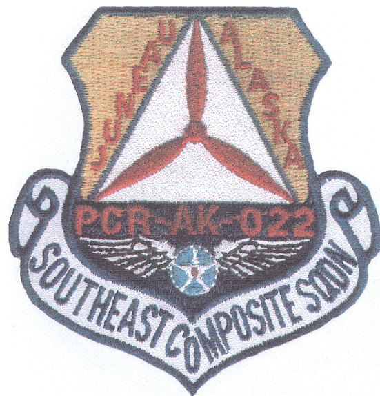
AK – Juneau Southeast Composite Sq. (AK022)