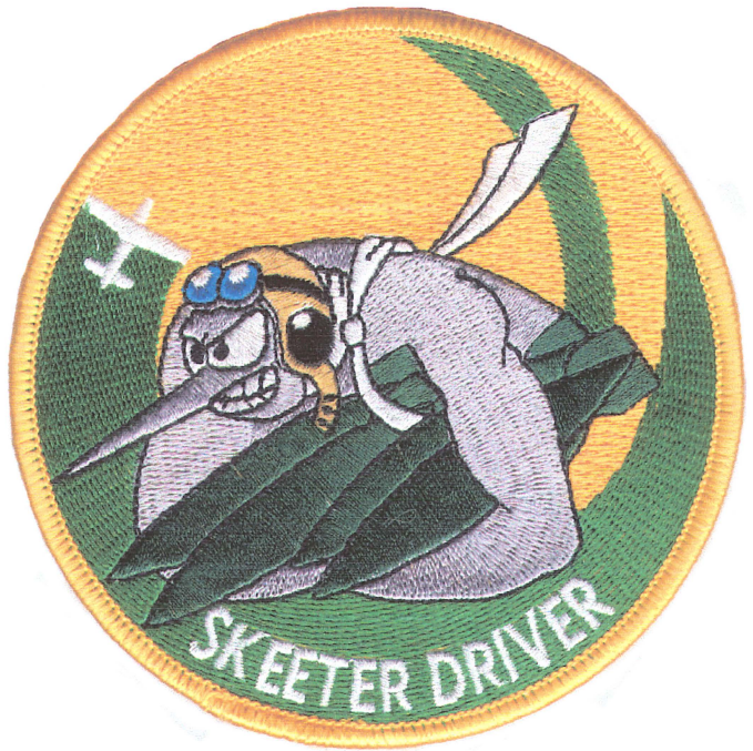
AK – University of Alaska AFROTC Squadron (AKR01)