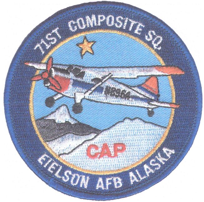
AK – Eielson 71 st Composite Squadron (AK071)