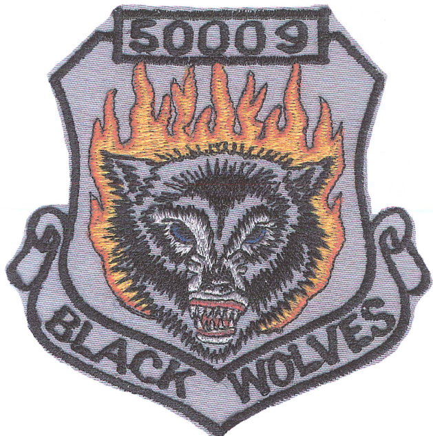
AK – Fairbanks Composite Squadron (50009)