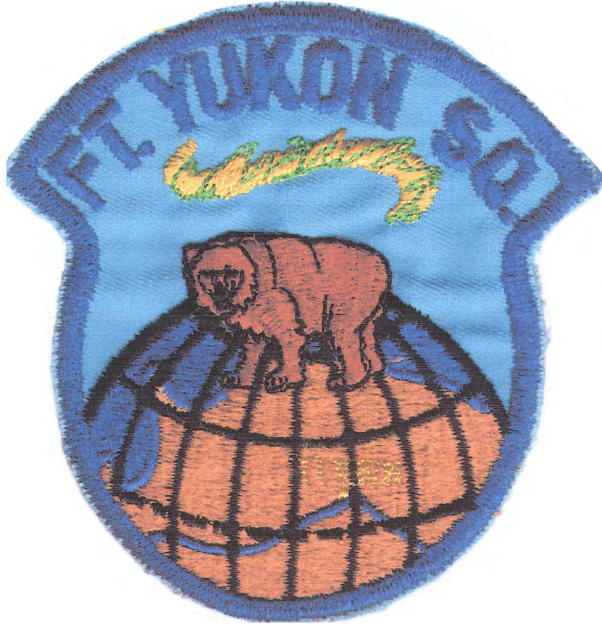
AK – Fort Yukon Composite Squadron (50070)