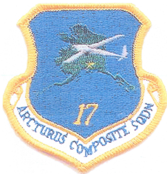
● AK – 17 th Composite Squadron (AK017)