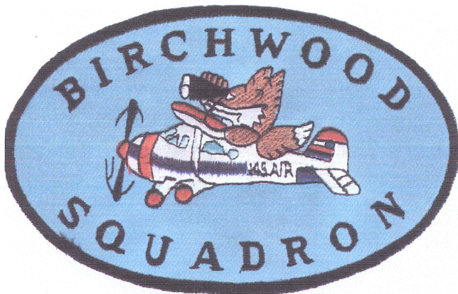
● AK – Birchwood Composite Squadron (AK 076)