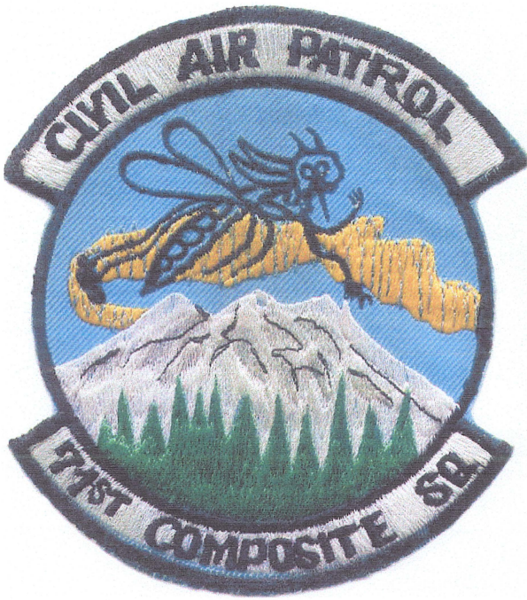
AK – Eielson 71 st Composite Squadron (50071)