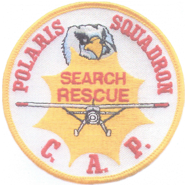
● AK – Anchorage Polaris Squadron (AK015)