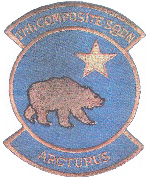
● AK – 17 th Composite Squadron (AK017)