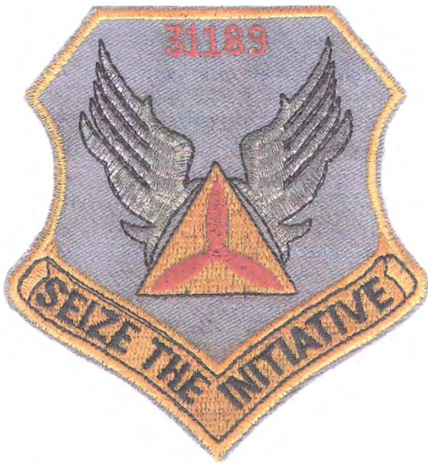
NY – Binghamton Cadet Squadron (31189)