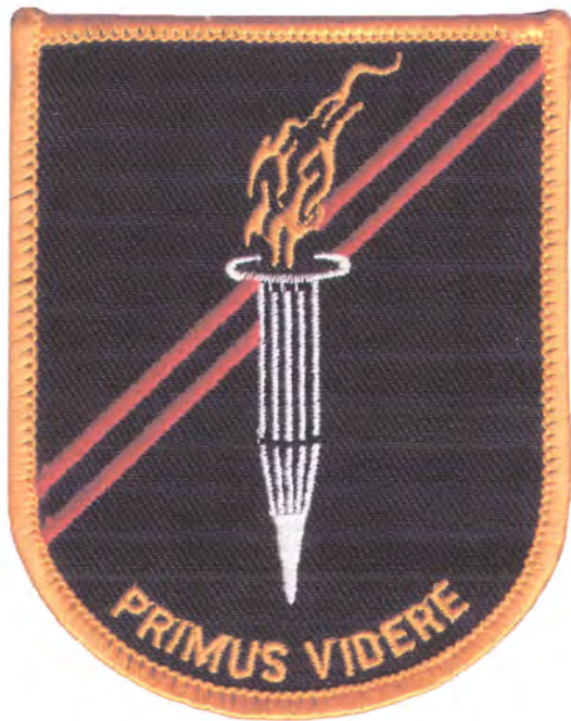
NY - Central New York Group (NY134)