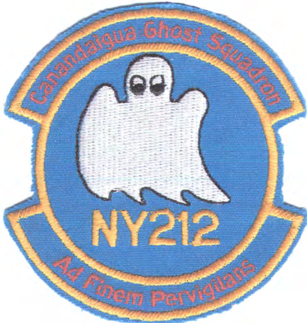
NY – Canandaigua Composite Squadron (NY212)