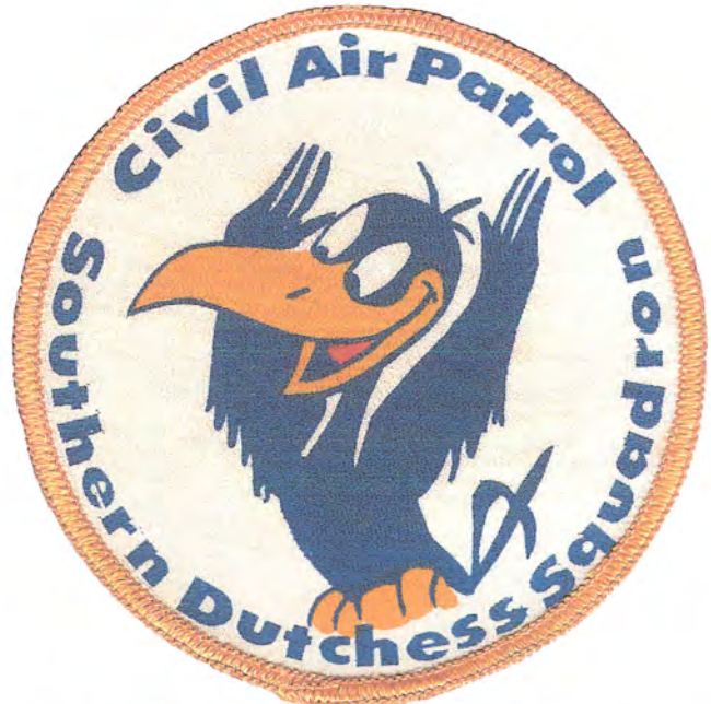
NY – Southern Dutchess Senior Squadron (31537)