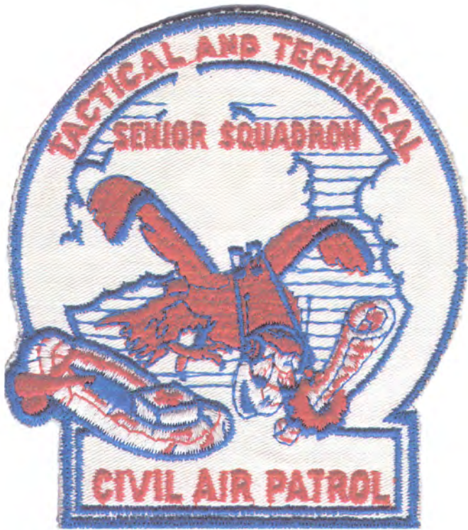
NY – Tactical and Technical Senior Sq. (31???)