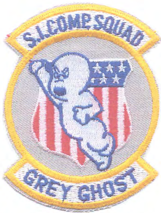
● NY – Staten Island Composite Squadron (NY374) *