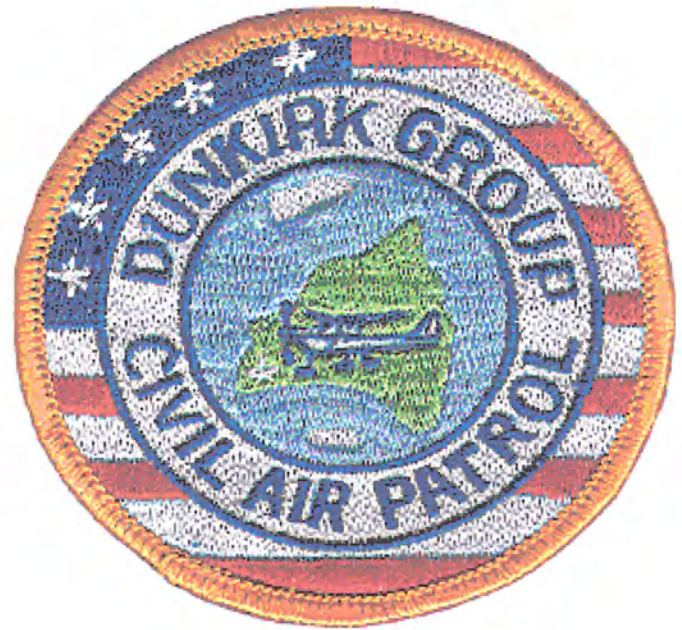
NY - Dunkirk Group (31352)