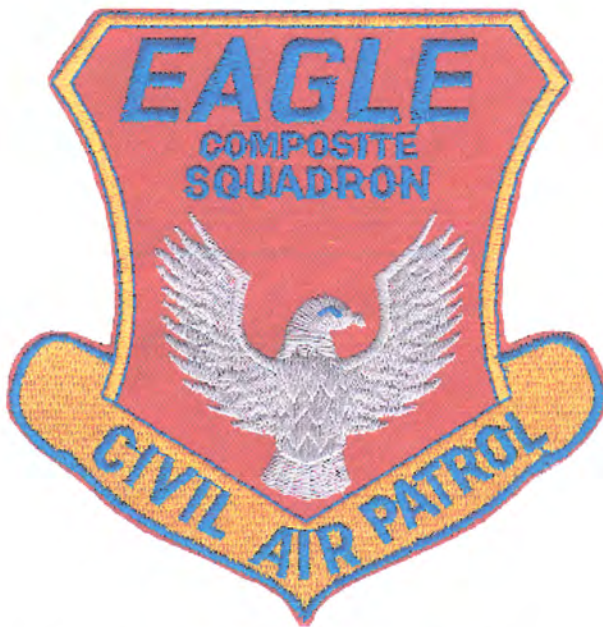
NY – Eagle Composite Squadron (31294)

It is unknown whether this design has been made into a patch.