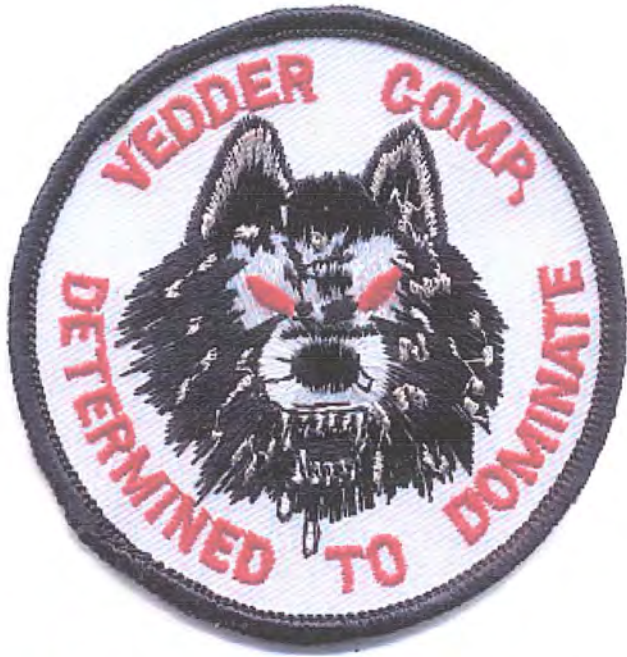
NY – Vedder Composite Squadron (NY392)