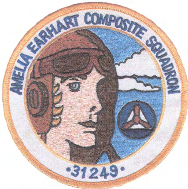
NY - Amelia Earhart Composite Squadron (31249)