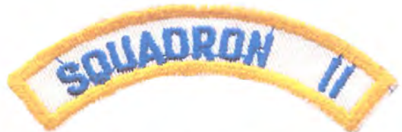
● NY – Nassau Composite Squadron II (31103)

Arc worn over the Long Island Group patch.