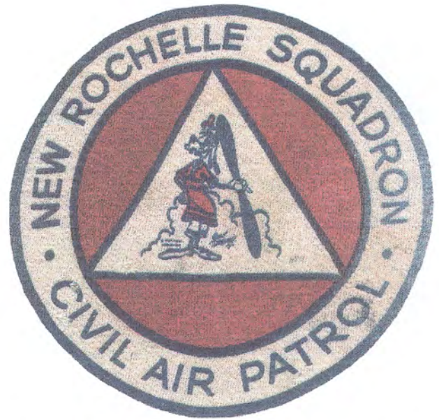
□ NY – New Rochelle Cadet Squadron 1956 to 1967 (31???)

This design, printed here on a T-shirt, was later used for all the Westchester Group cadets. 6 ¼" wide.