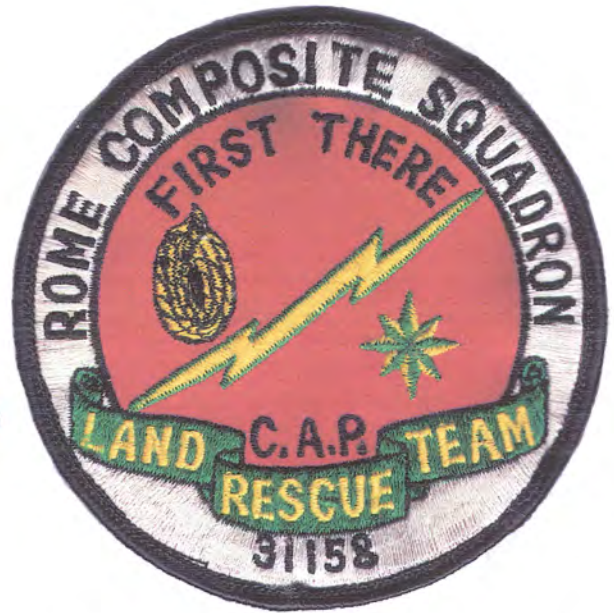
NY – Rome Composite Squadron (31158)