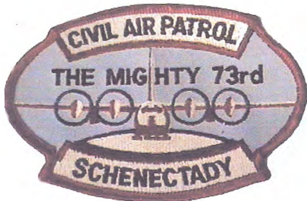
NY – Schenectady Composite Squadron (NY073)