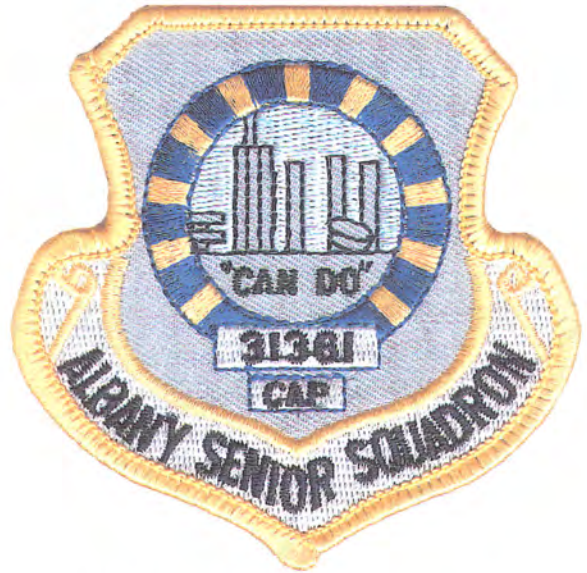
NY - Albany Senior Squadron (31361)