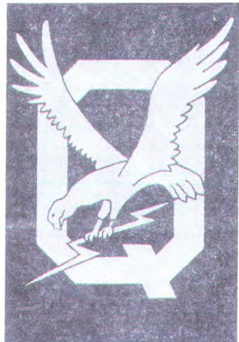
NY – Queens Group (31???) *