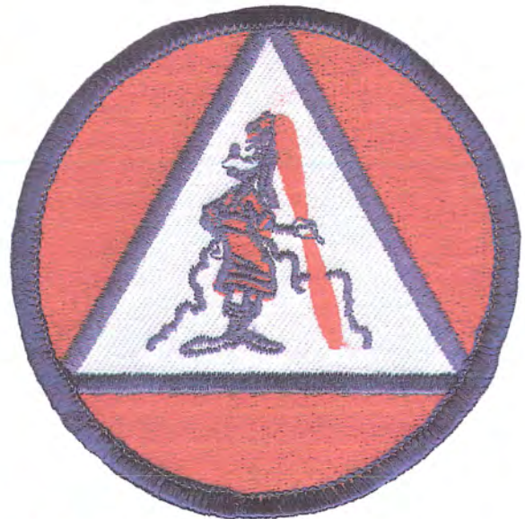
● NY - Westchester Group Cadets (31118)