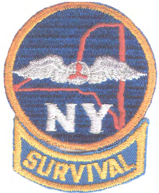
NY – Land Rescue School Graduate Tab