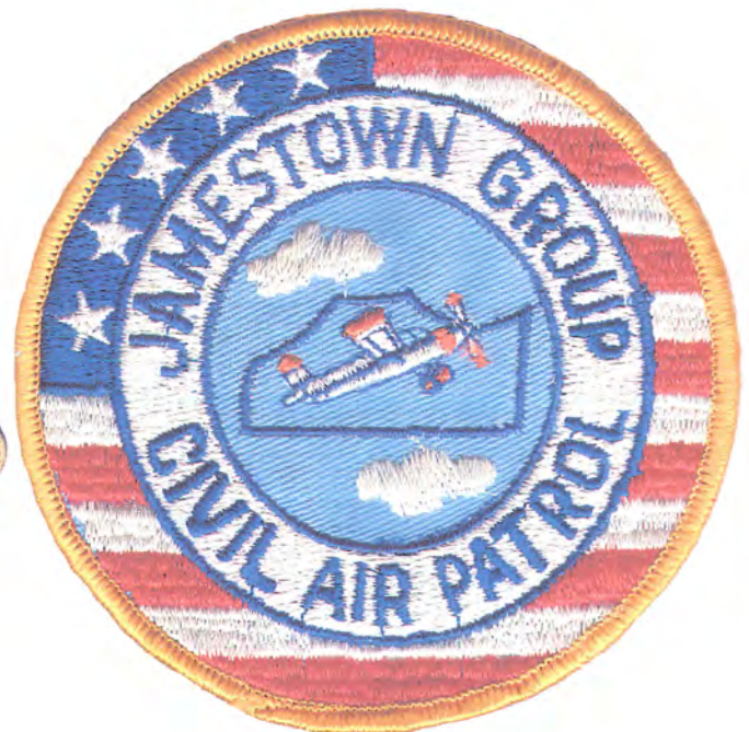
NY - Jamestown Group (31???)