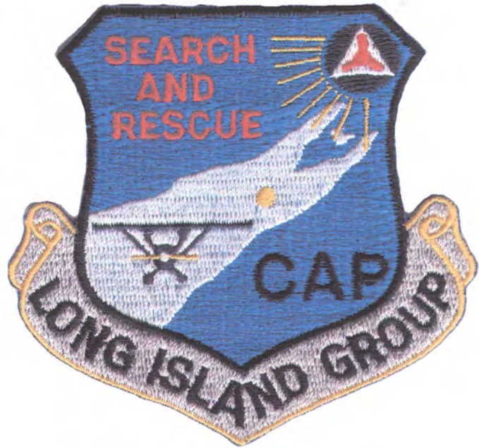
● NY – Long Island Group (NY251)

First design. Nassau Composite Squadron II arc sewn above. 4" wide.