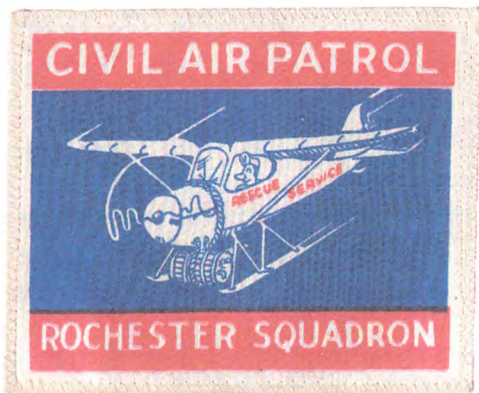
NY – Rochester Squadron (31???)