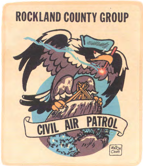
NY – Rockland County Group (31072)