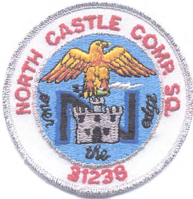
NY – North Castle Composite Squadron (31328)