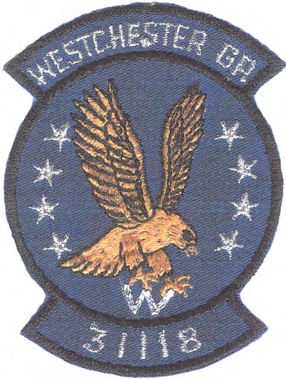
● NY - Westchester Group (31118)