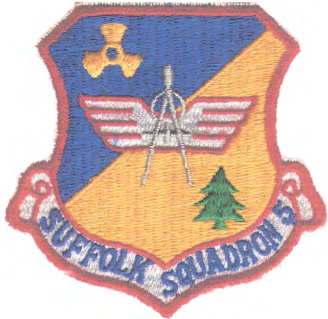
● NY – Suffolk Squadron 5 (31???)