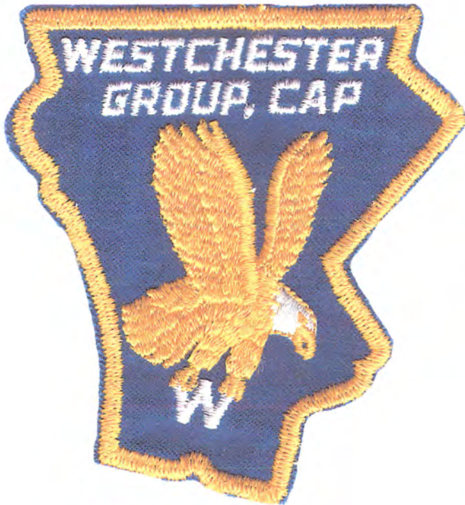
● NY - Westchester Group (31118)

Second design. Hand-colored "W" worn only by Group staff personnel.