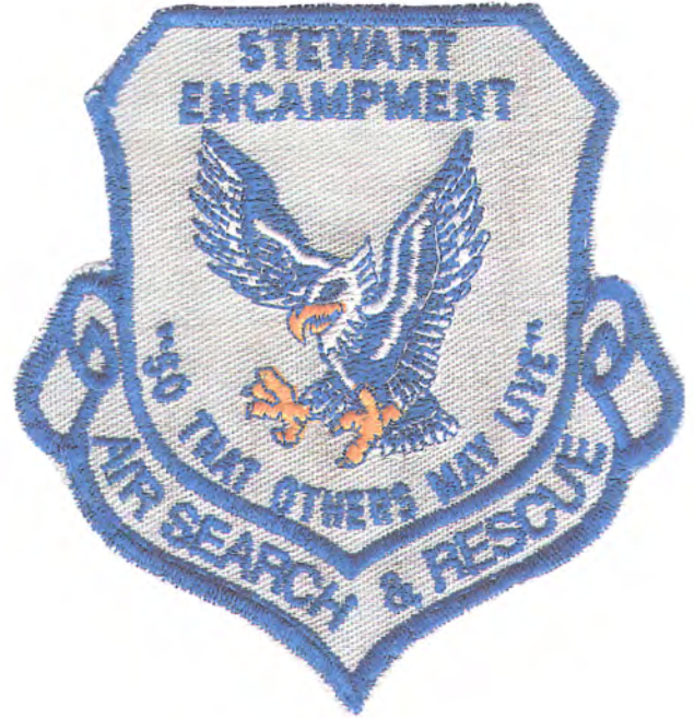
NY – Stewart AFB Encampment