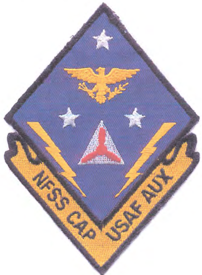
● NY – Niagara Frontier Senior Sq. ► (NY343)