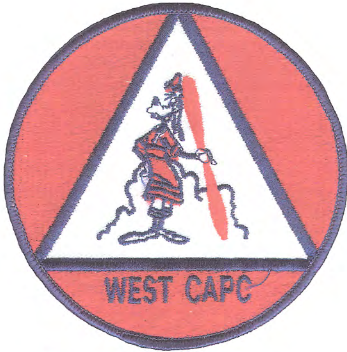
NY - Westchester Group Cadets (31118)