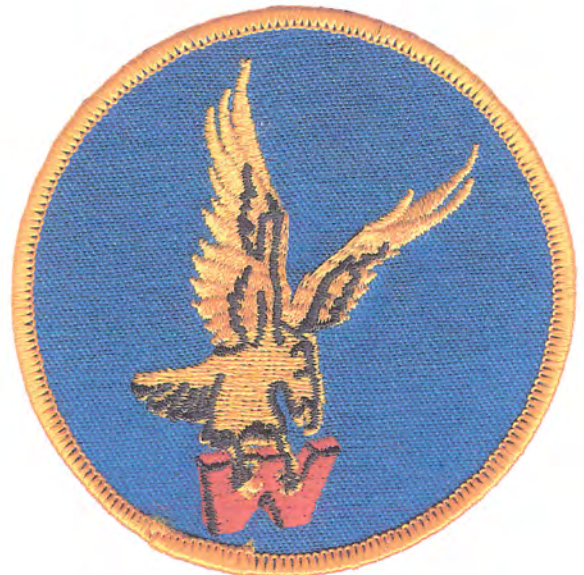
● NY – Westchester Group (31118)

First design, smaller, without lettering.