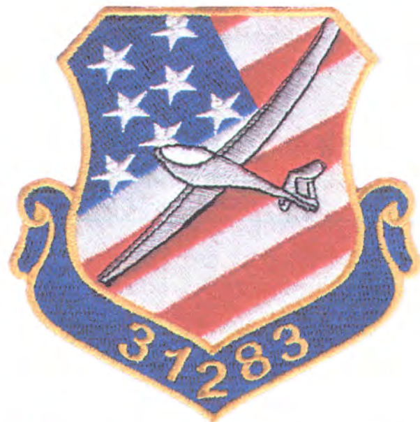
NY – Chemung Schuyler Composite Sq. (31283)