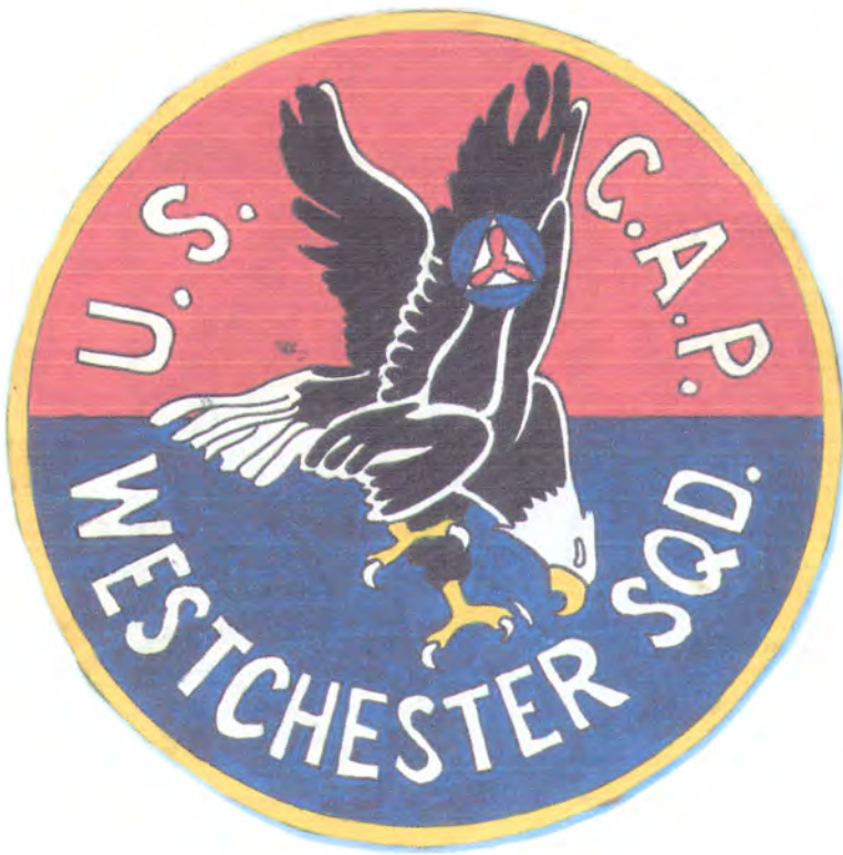
NY – Westchester Squadron (WW II) Painted on leather. 6” wide.