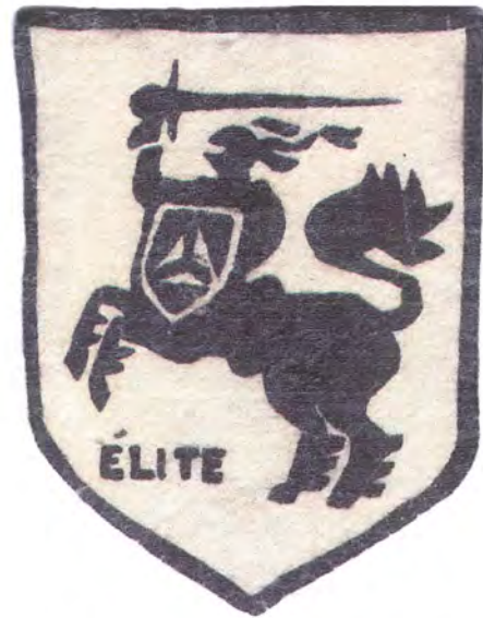
NY – Westchester Cadet Squadron 1 (31048)