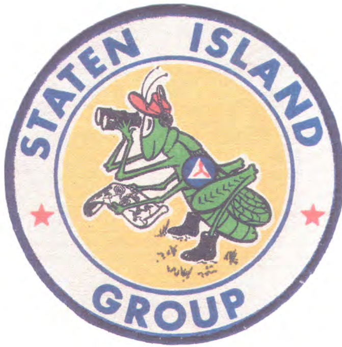
□ NY – Staten Island Group

First variation. A possible World War II patch. Silkscreen on denim, 6 ¼" wide.