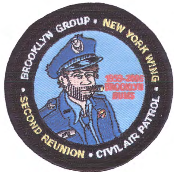
NY – Brooklyn Group Second Reunion (31091)

Party patch, not for wear on the uniform.