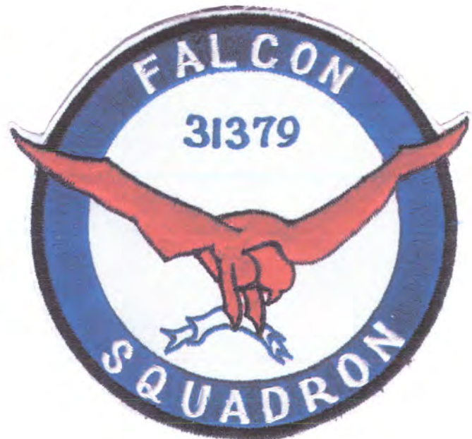
NY – Falcon Squadron (31379)