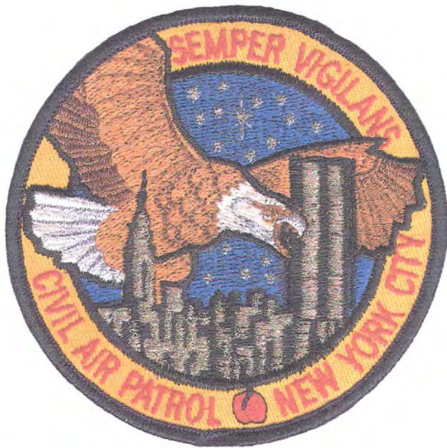
NY – New York City Group (NY015)