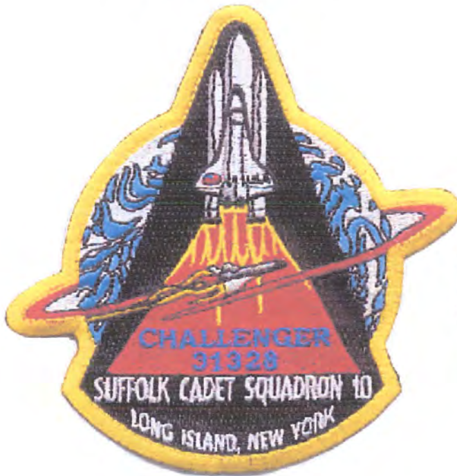
● NY – Suffolk Cadet Sq. 10 (31328)