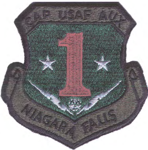
□ NY – Niagara Falls Composite Sq. 1 (NY116)

This design, printed here on a T-shirt, was later used for all the Westchester Group cadets. 6 ¼" wide.