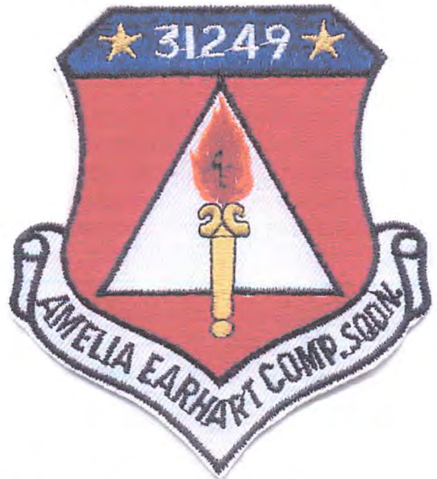
NY - Amelia Earhart Composite Sq. (31249)