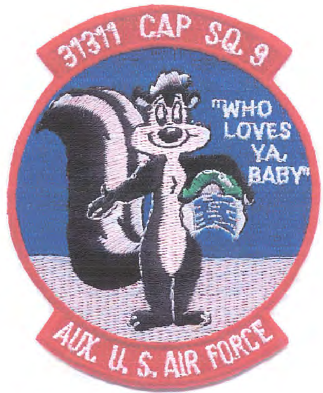
● NY – Suffolk Cadet Squadron 9 (31311)