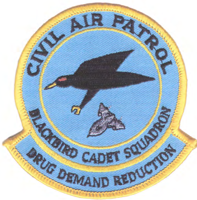
NY – Rochester Cadet Squadron (NY273)