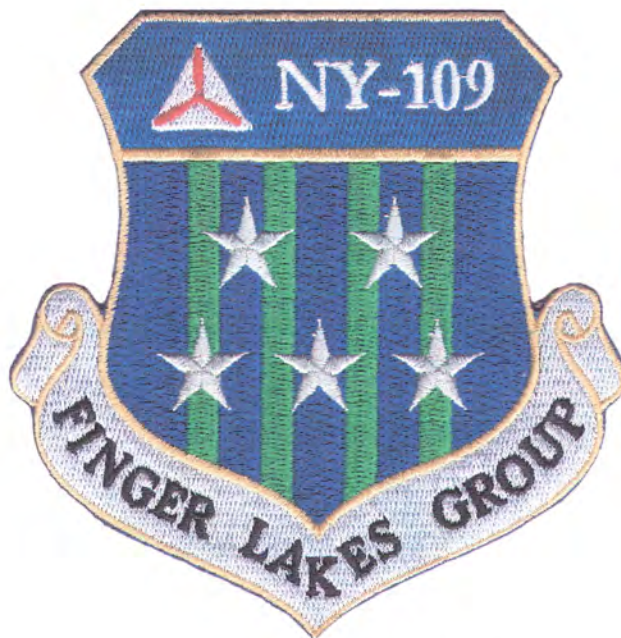
NY - Finger Lakes Group (NY109)