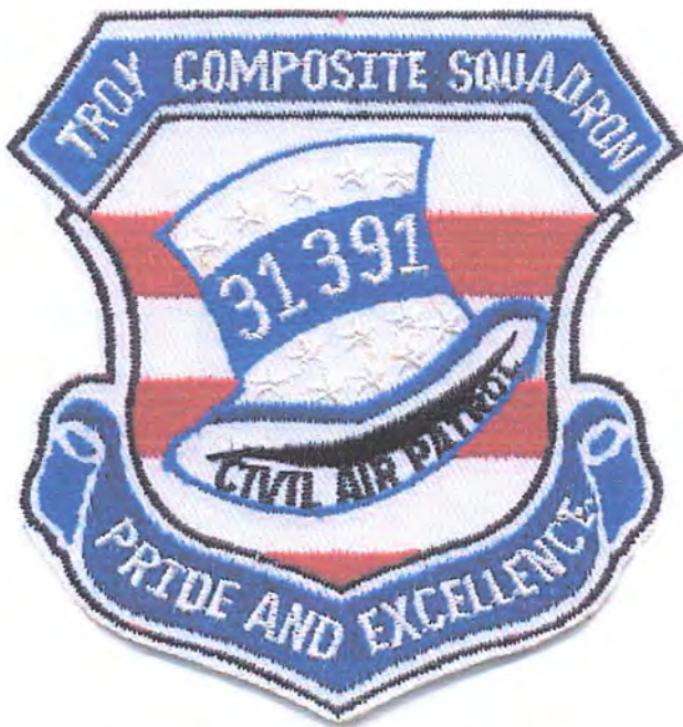
NY – Troy Composite Squadron (31391)