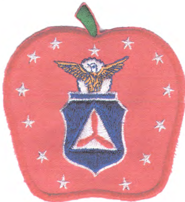
□ NY – Manhattan Group (31015)