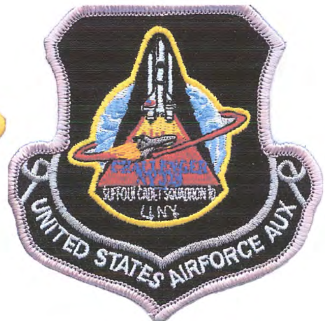
□ NY – Suffolk Cadet Squadron 10 (31328)