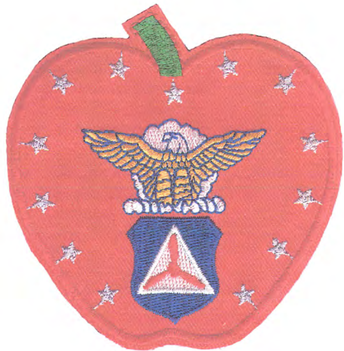
□ NY – Manhattan Group (31015)