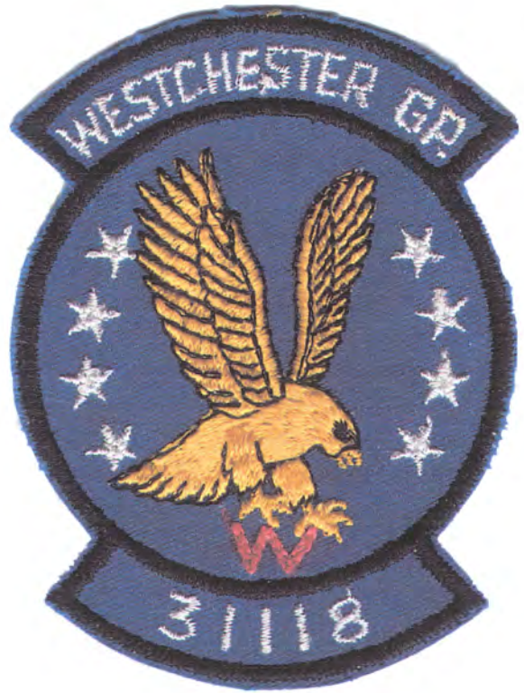
□ NY - Westchester Group (31118)

Second design. Hand-colored "W" worn only by Group staff personnel.