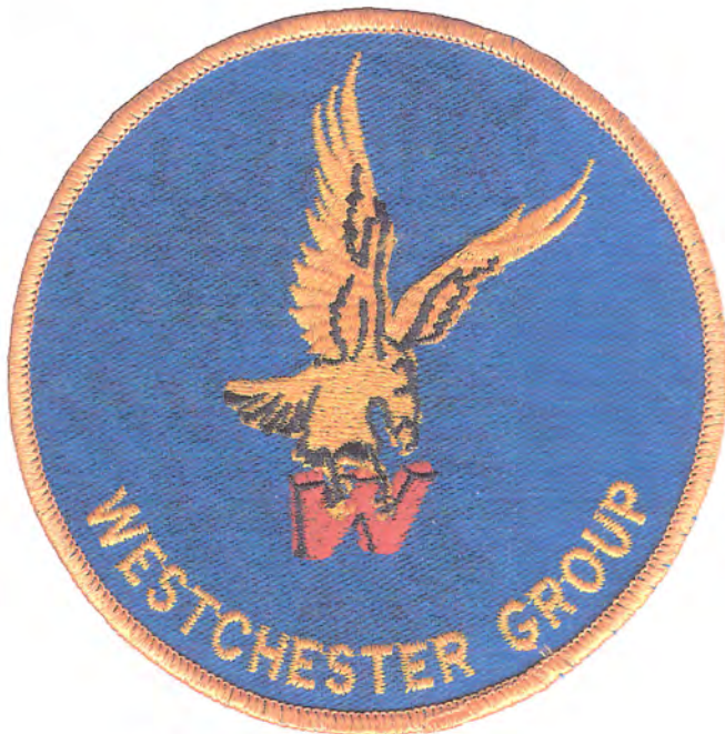
● NY – Westchester Group (31118)