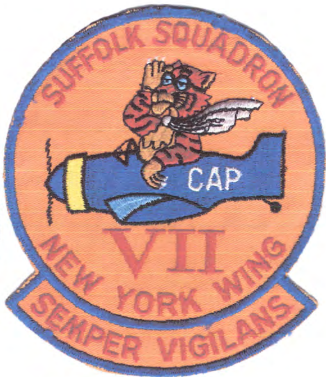
□ NY – Suffolk Cadet Squadron 7 (NY153)