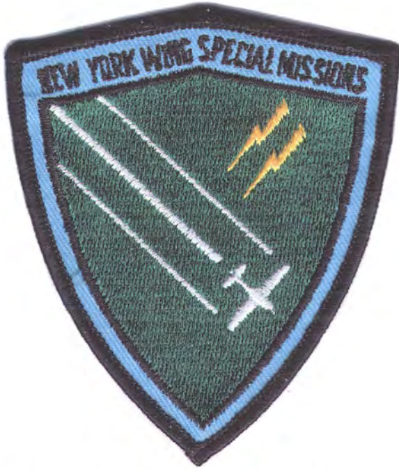
NY – New York Wing Special Missions For outstanding service in Counter Drug missions