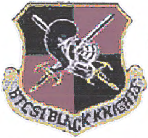
NY - Brooklyn Technical Cadet Squadron 1 (31088) *