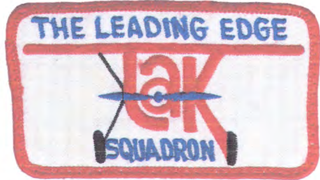
NY – Tak Composite Squadron (NY175)