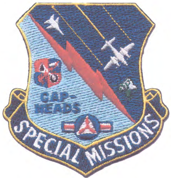
NY – New York Wing Special Missions (NY001)

Worn by New York Wing aircrews flying special missions in support of the Northeast Air Defense Sector.