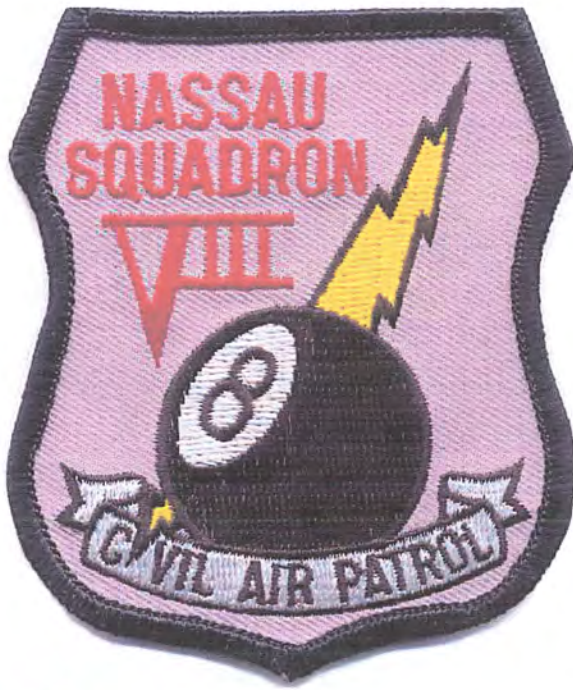
● NY – Nassau Cadet Squadron VIII (NY288)