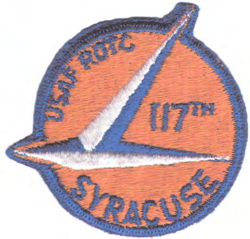
NY – Syracuse University AFROTC Squadron (NYR04)