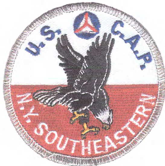
NY – Southeastern Group (NY118)