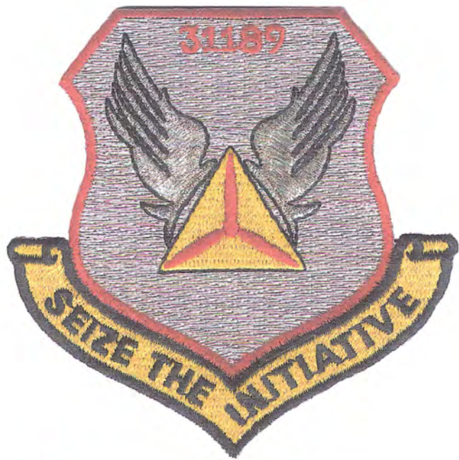
NY – Binghamton Cadet Squadron (31189)