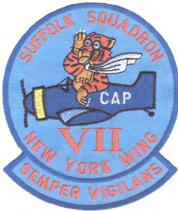
● NY – Suffolk Cadet Squadron 7 (NY153)