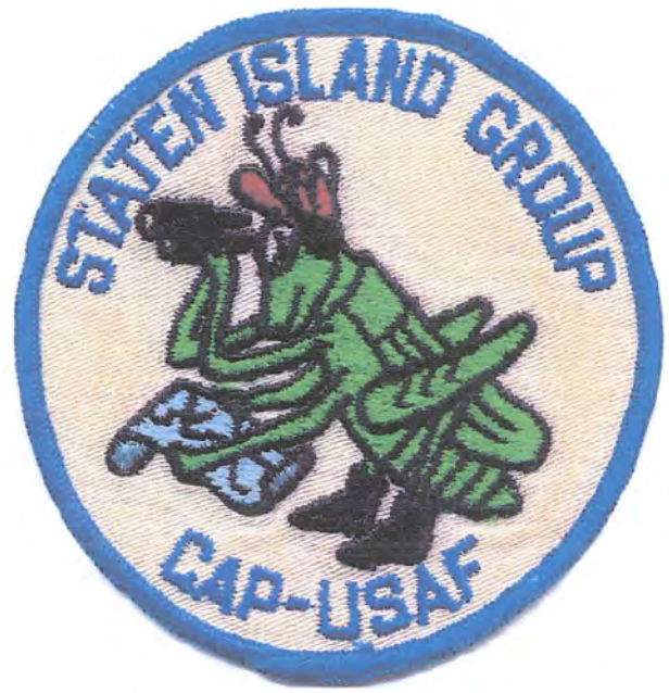
● NY – Staten Island Group (31???) *

First variation. A possible World War II patch. Silkscreen on denim, 6 ¼" wide.