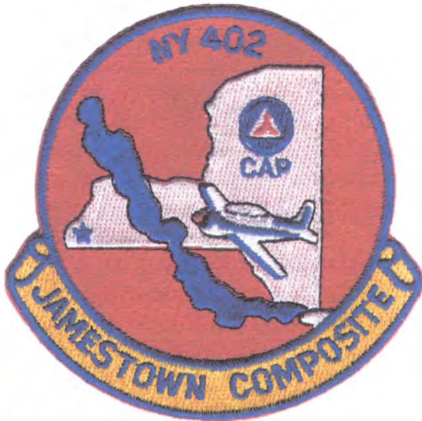
● NY – Jamestown Composite Squadron (NY402)