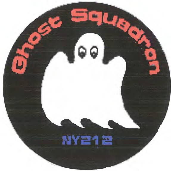
NY – Canandaigua Composite Squadron (NY212) *