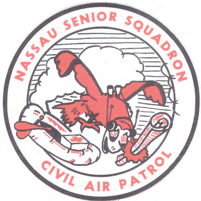
□ NY – Nassau Senior Squadron (31207)