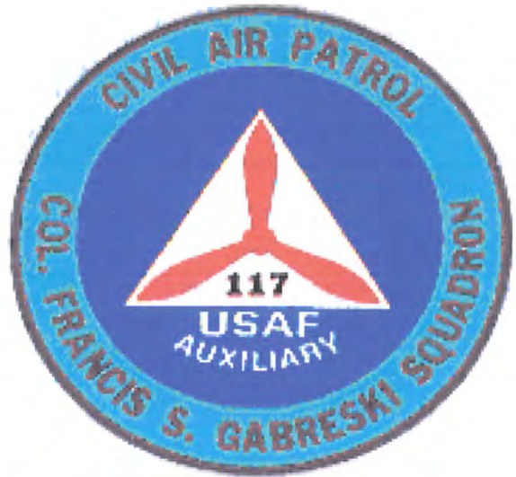
NY – Col. Francis S. Gabreski Squadron (NY117)

It is unknown whether this design has been made into a patch.