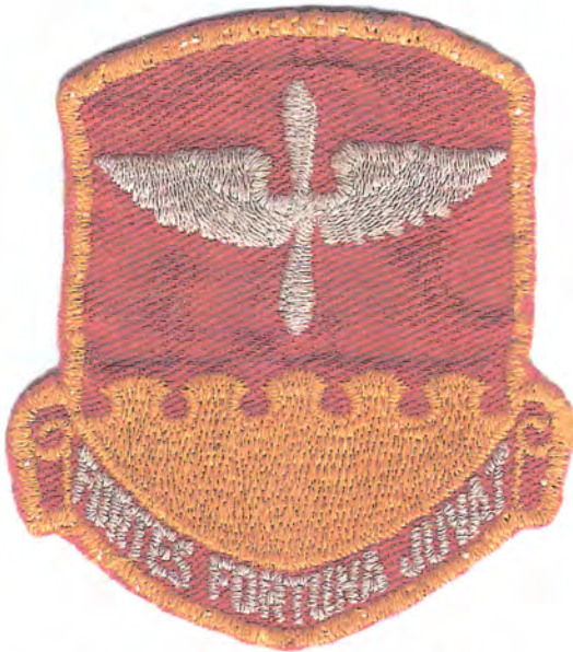
NY – Bronx Group Drill Team (31091)