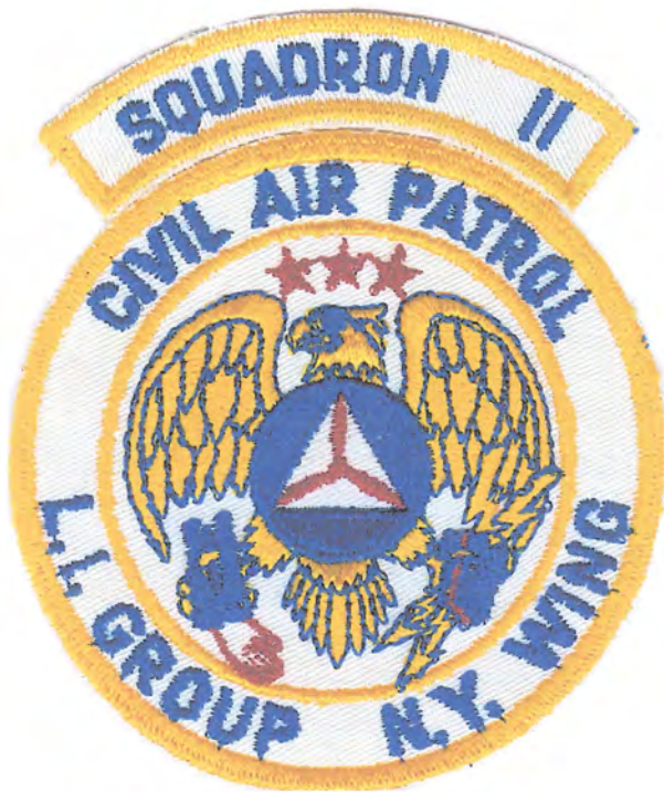
● NY – Long Island Group (14251)

First design. Nassau Composite Squadron II arc sewn above. 4" wide.