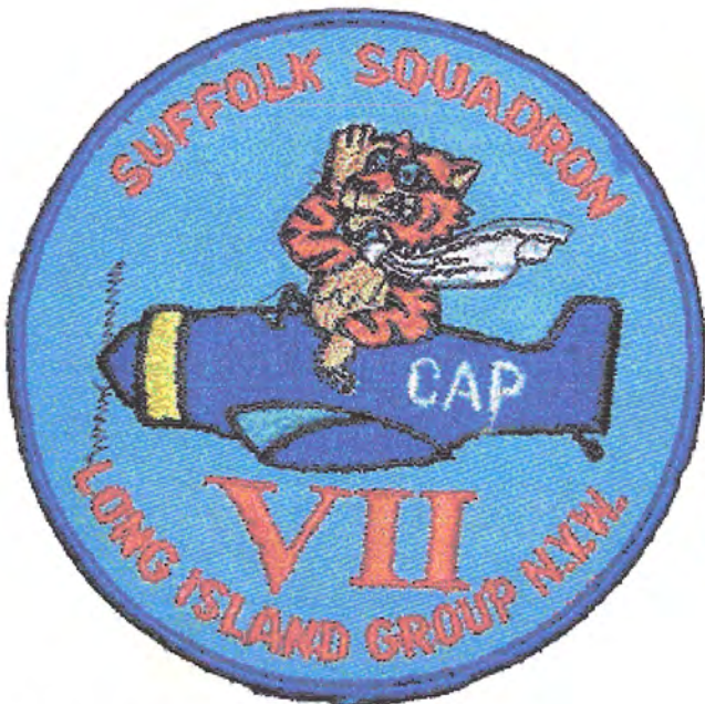
□ NY – Suffolk Cadet Squadron 7 (NY153) *