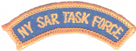
NY – Search and Rescue Task Force