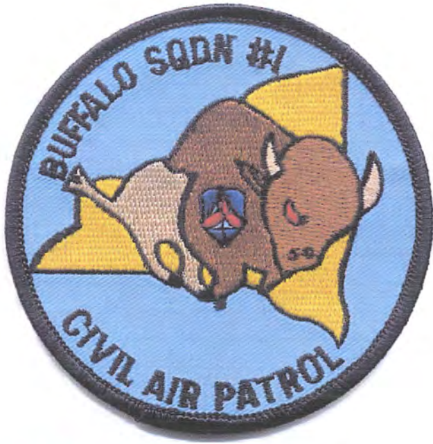
NY – Buffalo Cadet Squadron 1 (NY022)