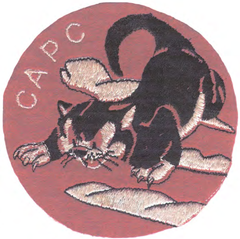
NY - Bronx Cadet Squadron (31088)