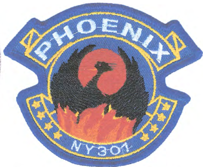
NY – Phoenix Composite Squadron (NY301)