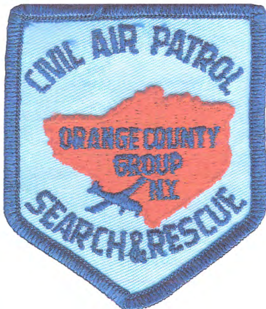
NY – Orange County Group Search and Rescue (31035)