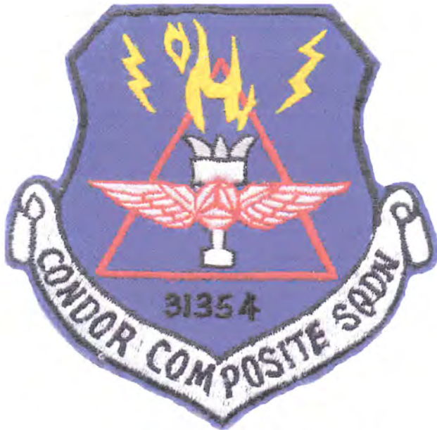
NY – Condor Composite Squadron (31354)