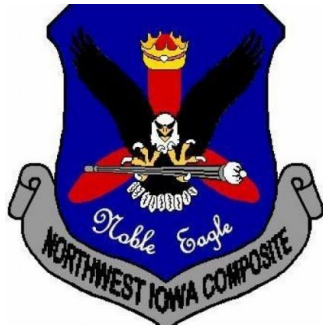
Figure 7: IA-007 Patch

Northwest Iowa Composite Squadron (NWICS) year in review in recognition of their dedication to the three missions of Civil Air Patrol.