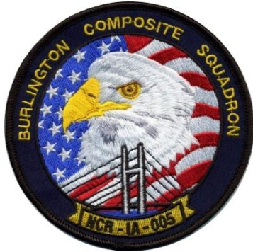
Figure 6: IA-005 Patch