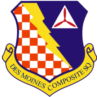
Figure 4: IA-002 Patch