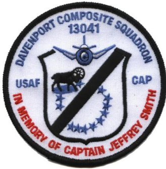
Figure 8: IA-041 Patch