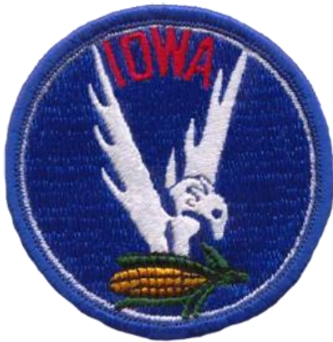
Figure 11: Iowa Wing Patch