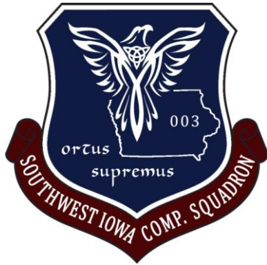
Figure 5: IA-003 Patch

The squadron continues to actively support wing activities despite being located on the western side of the state. The most notable activity was helping to host the 2013 Iowa Wing Encampment. Cadets continue to progress through the cadet milestones as the squadron awarded the Wright Brothers Award, General Billy Mitchell Award, and the Amelia Earhart Award this year. Southwest Iowa continues to support the local community by volunteering support to the annual Red Oak Fly-Inn. Although, no aircraft attended due to poor weather, over 300 people turned out for the breakfast. The squadron ended the year with 31 members (17 senior members and 14 cadets). The squadron looks forward to the 2014 year.