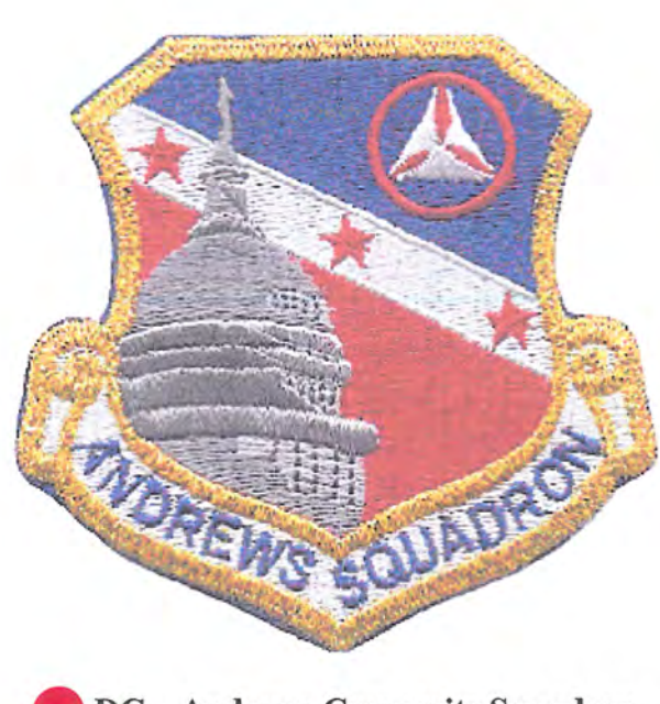
DC – Andrews Composite Squadron (DC033)