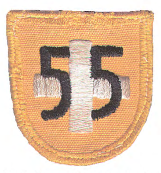
DC - Crescent City Cadet Squadron Beret Flash (25055)