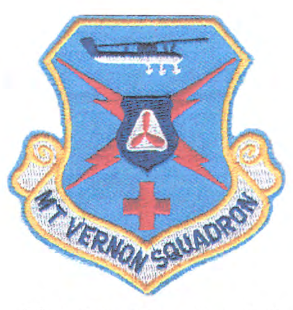
DC – Mount Vernon Composite Sq. (DC045

First variation. White landing gear close to the fuselage.