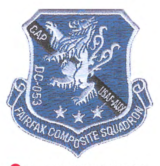
DC – Fairfax Composite Squadron (DC053)