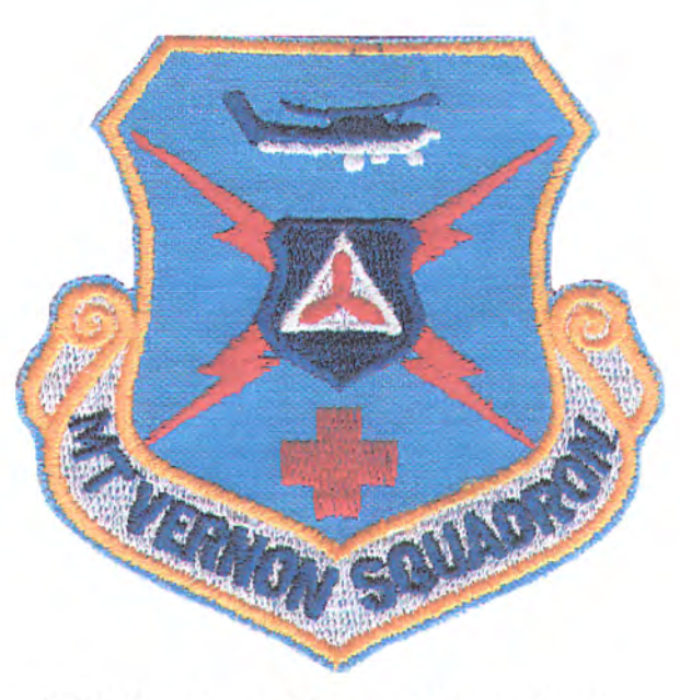
☐ DC – Mount Vernon Composite Sq. (DC045)

First variation. White landing gear close to the fuselage.