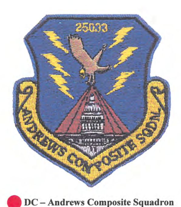
First design, first variation. Charter number is in yellow.