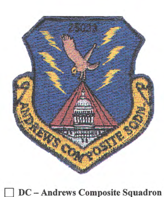
First design, second variation. Charter number is in black.