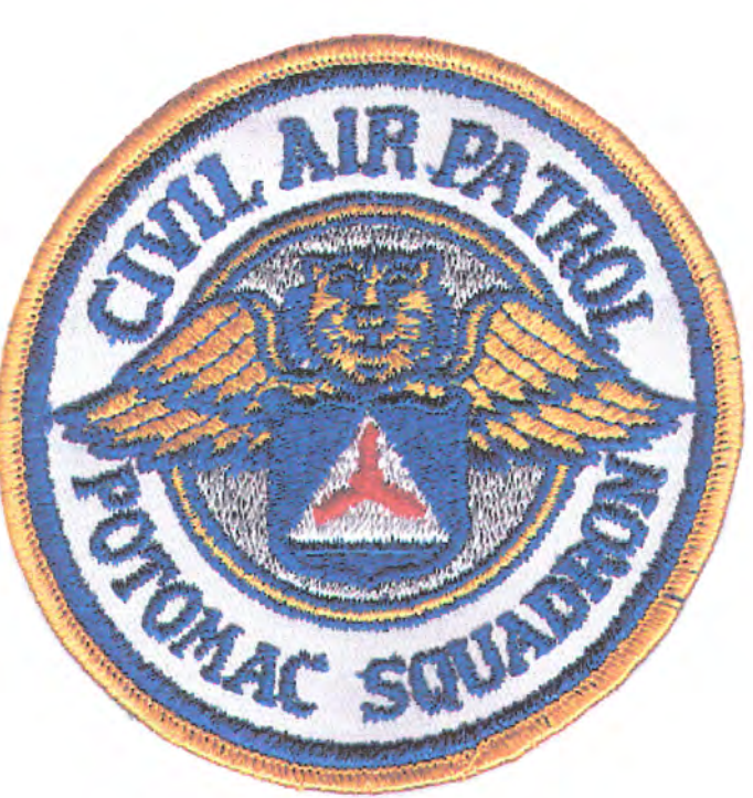
DC - Potomac Cadet Squadron (25054)

Third variation. Spread landing gear with blue tires.