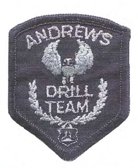
DC – Andrews Composite Squadron Drill Team (25033)