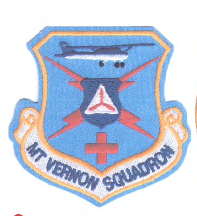
DC – Mount Vernon Composite Sq. (DC045)

Second variation. Narrower patch, white landing gear away from the fuselage