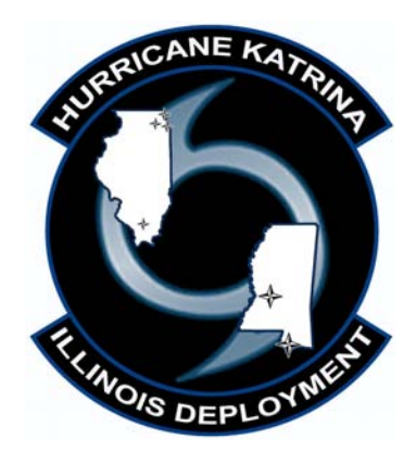
Illinois Wing Hurricane Katrina Deployment (awarded to who deployed in support of Hurricane Katrina relief from 7-14 Sept 2005)