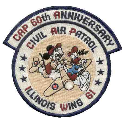
Illinois Wing Patch (new) (with or without rocker)