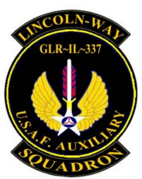
IL-337 Lincoln-way Composite Squadron