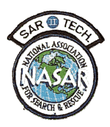
The National Association for Search & Rescue (NASAR), Search and Rescue Technician (SARTECH) patch