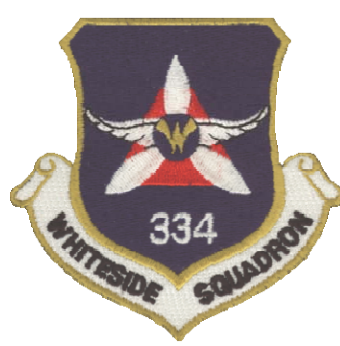
IL-334 Whiteside County Composite Squadron *