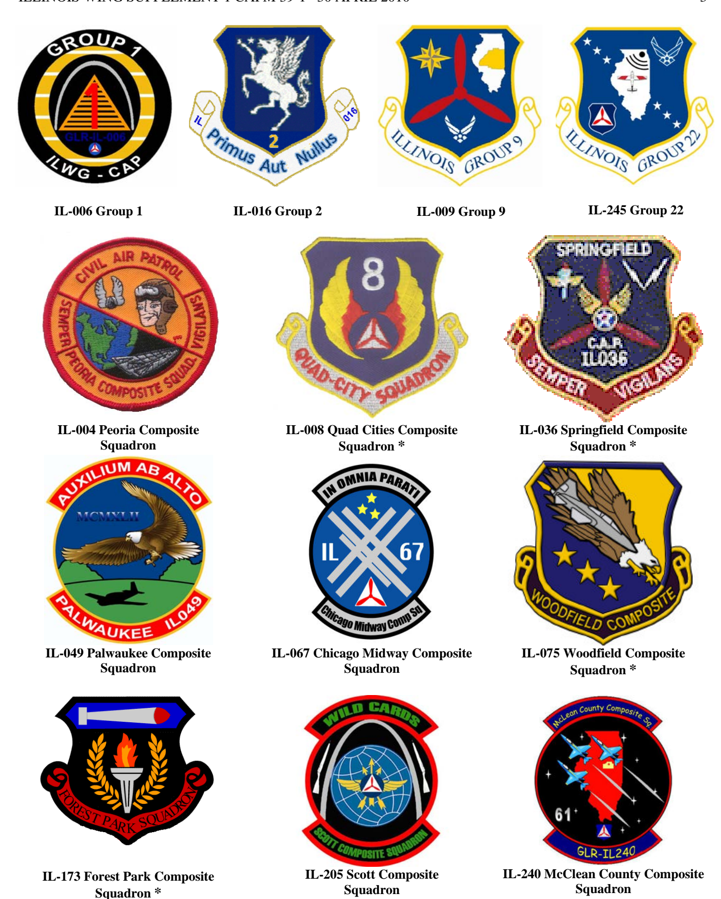
Figure 6-19. Patches Worn on Lower Right Pocket of BDUs, Field Uniforms and Utility Uniforms, and ½ inch below Right Shoulder Seam of Flight Suits (Wear only one) (Continued)