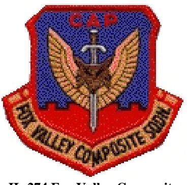
IL-274 Fox Valley Composite Squadron *