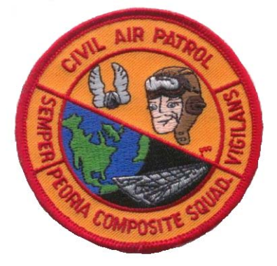
IL-004 Peoria Composite Squadron