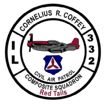
IL-332 Cornelius Coffey Composite Squadron