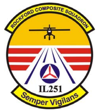
IL-251 Rockford Composite Squadron