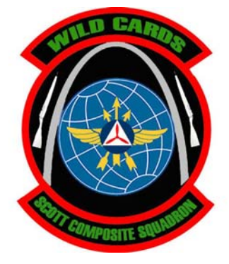
IL-205 Scott Composite Squadron