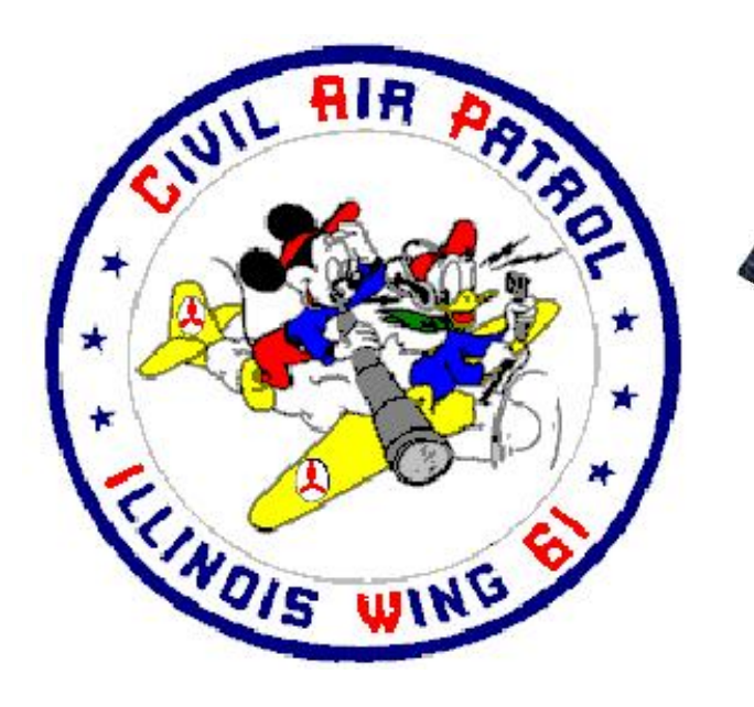
Illinois Wing Patch "Disney" (old)