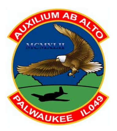
IL-049 Palwaukee Composite Squadron