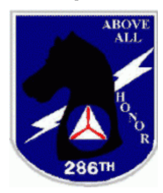
IL-286 286<sup>th</sup> Composite Sauadron