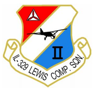
IL-329 Lewis Composite Sauadron *