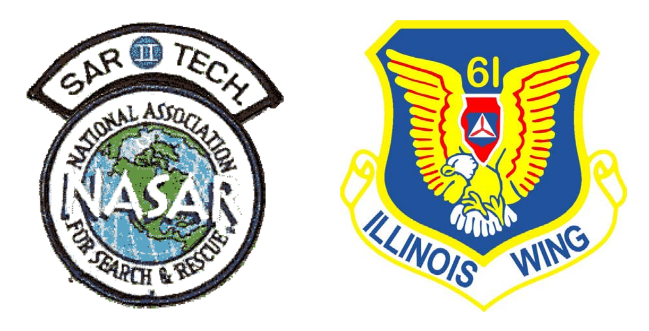
The National Association for Search & Rescue (NASAR), Search and Rescue Technician (SARTECH) patch