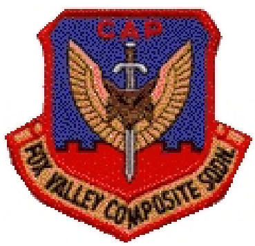
IL-274 Fox Valley Composite Squadron *