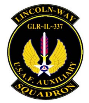
IL-337 Lincoln-way Composite Squadron

Figure 6-19. Patches Worn on Lower Right Pocket of BDUs, Field Uniforms and Utility Uniforms, and ½ inch below Right Shoulder Seam of Flight Suits (Wear only one) (Continued)