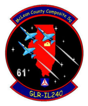
IL-240 McClean County Composite Squadron