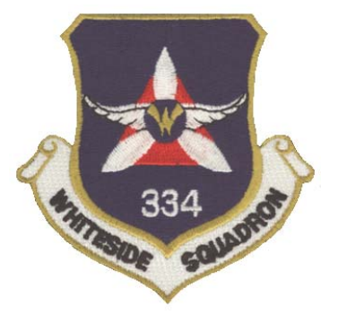
IL-334 Whiteside County Composite Squadron *