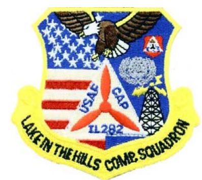
IL-282 Lake in the Hills Composite Sauadron *