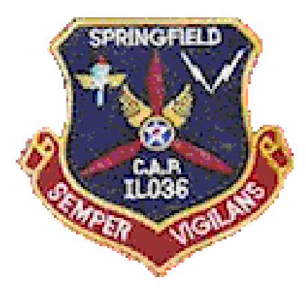
IL-036 Springfield Composite Squadron *