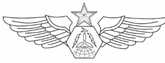
CAP Senior sUAS Pilot