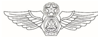
CAP Master sUAS Technician