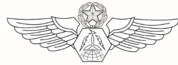
CAP Command sUAS Pilot