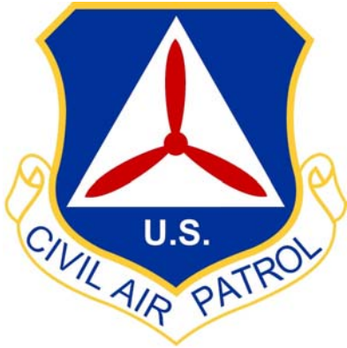
New Command Patch Design