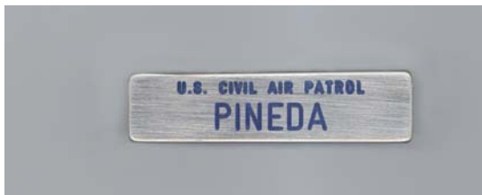
CAP Corporate Service Coat Name Tag