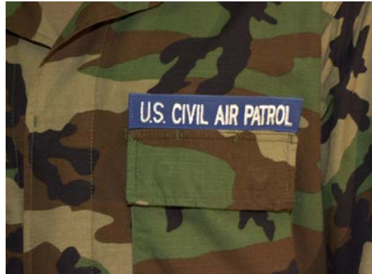
Tape worn on BDUs and Field Uniforms