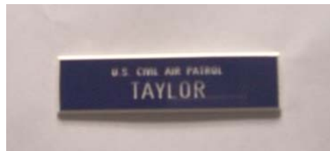
White Aviator Shirt w/AF Pants Name Tag