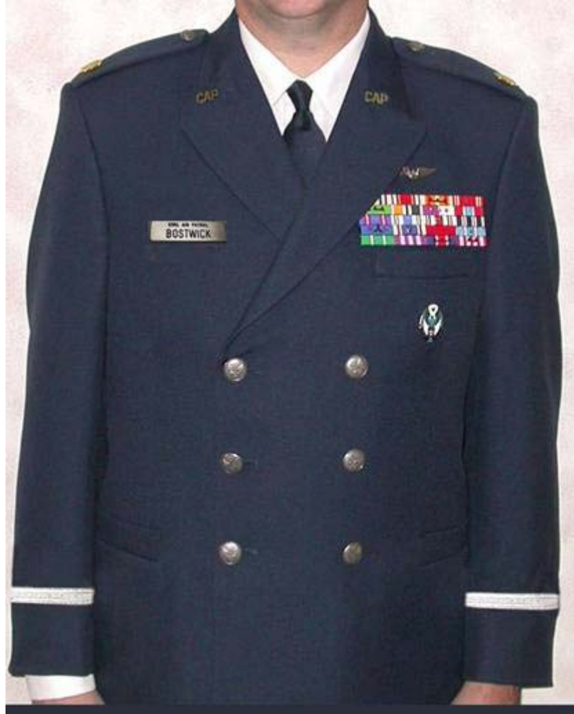
Corporate Service Coat with CAP Lapel Device