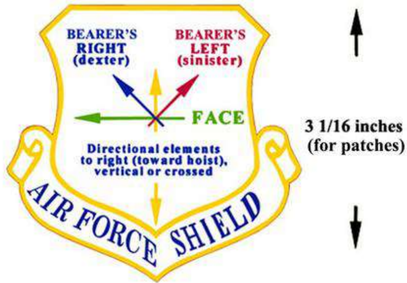
Figure 1. Shield Design Format and Example of Emblem for Groups and Above (All Flag Bearing Organizations).