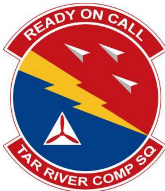
Sample - actual size

For a unit's scroll (s), use any color as long as the overall design has six or fewer colors and the border of the disc and scroll (s) are the same color as the letters on the scroll.