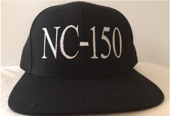
Embroidered Unit Designation