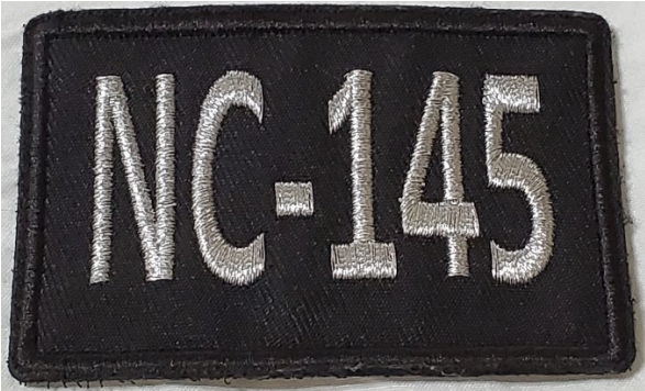
Velcro Embroidered Patch