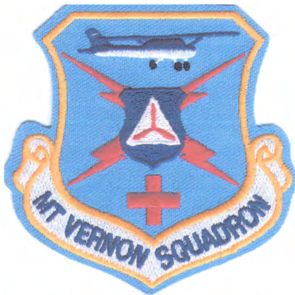
DC – Mount Vernon Composite Sq. (DC045)

Second variation. Narrower patch, white landing gear away from the fuselage