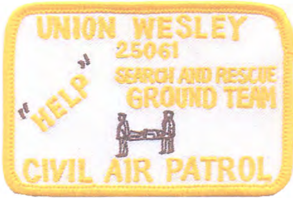
● DC – Union Wesley Cadet Squadron (25061)