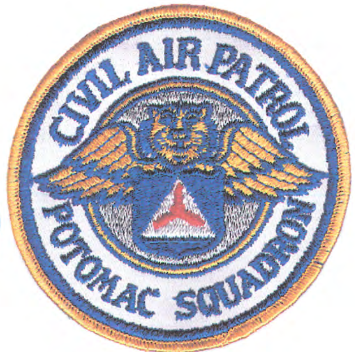
DC – Potomac Cadet Squadron (25054)

Third variation. Spread landing gear with blue tires.