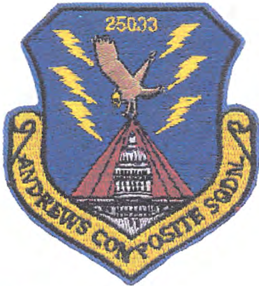
● DC – Andrews Composite Squadron (25033)

First design, first variation. Charter number is in yellow.