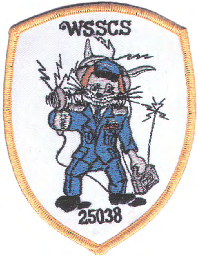
□ DC – Wheaton-Silver Springs Cadet Sq. (25038)