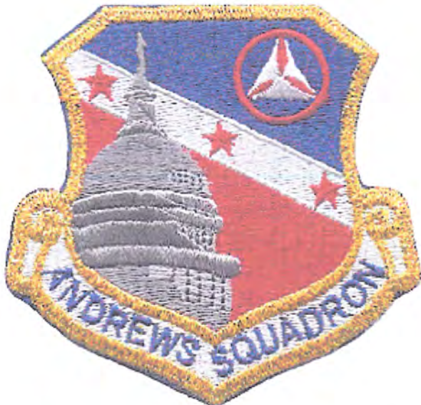
● DC – Andrews Composite Squadron (DC033)

First design, second variation. Charter number is in black.