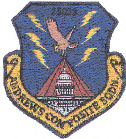
□ DC – Andrews Composite Squadron (25033)

First design, first variation. Charter number is in yellow.