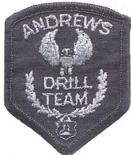
● DC – Andrews Composite Squadron Drill Team (25033)