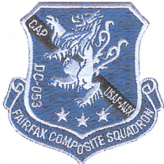
DC – Fairfax Composite Squadron (DC053)