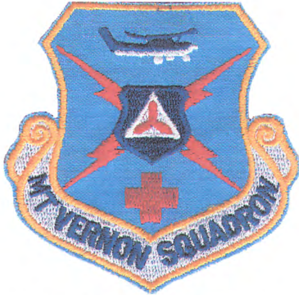
DC – Mount Vernon Composite Sq. (DC045)

First variation. White landing gear close to the fuselage.