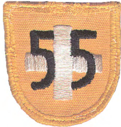
DC – Crescent City Cadet Squadron Beret Flash (25055)